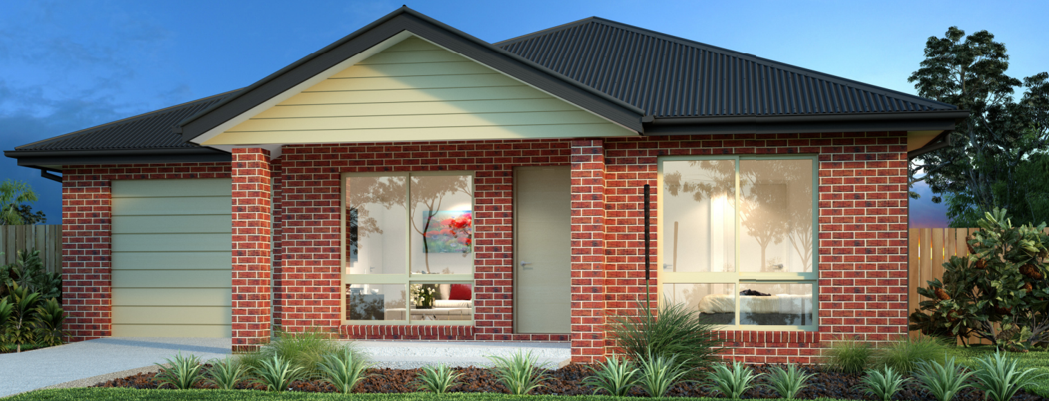
Artists impression - For illustrative purposes only

An opportunity awaits to purchase and own your investment whilst benefiting from the enjoyment, security and lifestyle of living with like minded people in a friendly community.