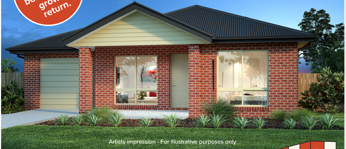
Artists impression - For illustrative purposes only

You own the asset, benefit from growth return.